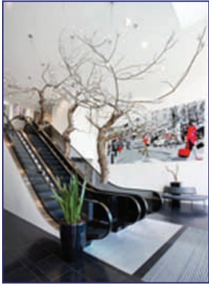
First Hotel G

The trial period of 30 days is completely free of charge – Add this powerful booking engine to your website, enhance it with destination information and start offering your own packages directly to markets around the world!