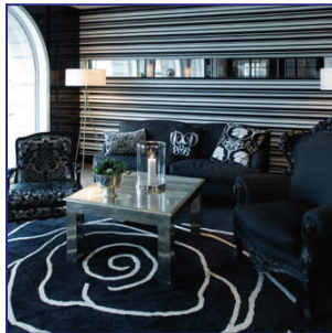
First Hotel Reisen