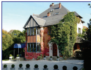
Manoir du Lac

The myfidelio direct connection to Expedia is handling the Expedia Special Rates (net): these are rates contracted between your hotel and Expedia directly. Instead of maintaining the Expedia Special rates, the allocations and restrictions via an Extranet, you will be able to maintain all these information in myfidelio.net. If your hotel has an interface between the Property Management System (PMS) and myfidelio, you will be able to maintain the rates, the inventory and the availability directly from your PMS.