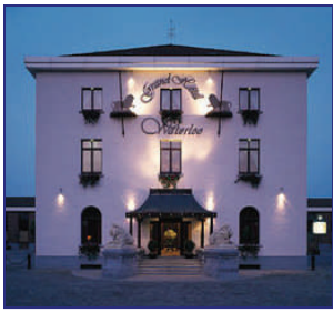
Grand Hotel Waterloo