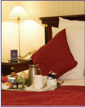
Martin's Central Park

Expedia's broad selection of travel products and services is available via the global website and via the local versions throughout Europe and partnerships in Asia Pacific: France, Germany, Italy, Netherlands, United Kingdom, Australia, Japan. Expedia is also available in the US and Canada.